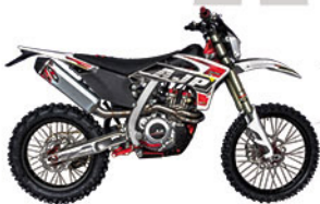
SPR 310 R