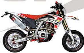
SPR 310 R